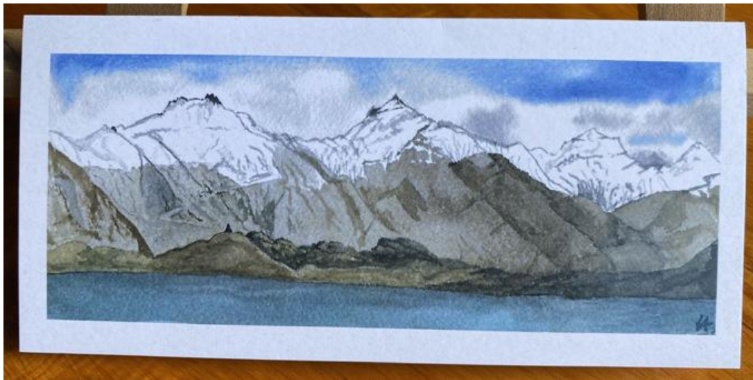
Winter views of Treble Cone, Black Peak, Fog Peak and Mt Niger